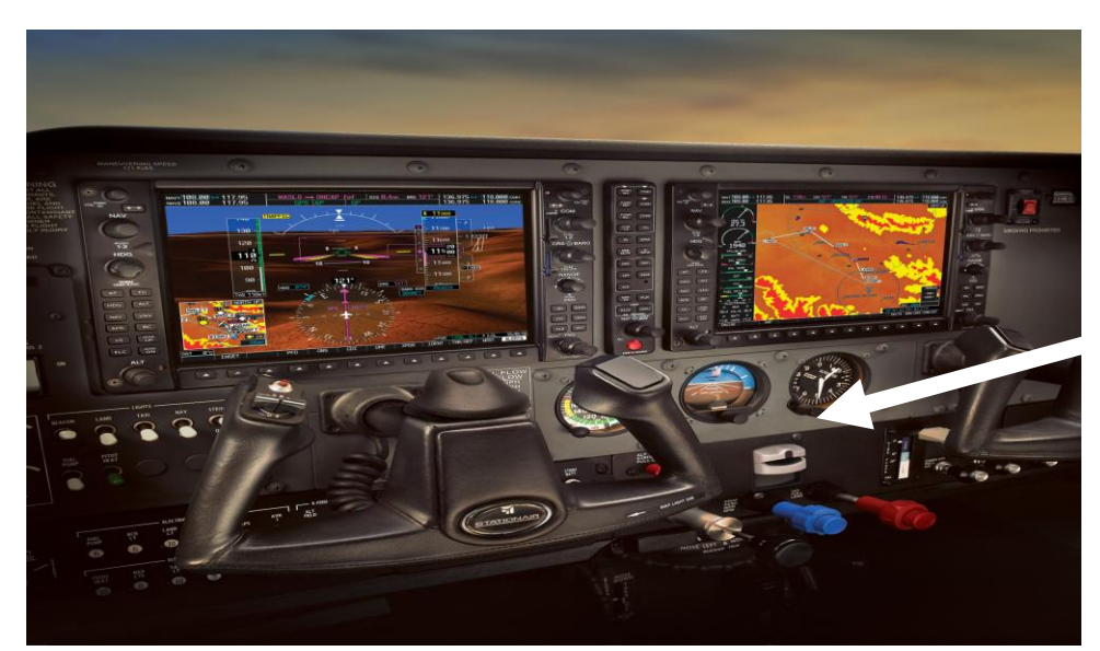
Oximeter and CO detector installed in the middle of the instrument panel

• Typical installation areas are depicted below in Pictures 3 & 4.