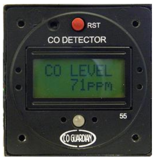
Picture 13 Aero 55 Displaying Carbon Monoxide level in parts per million (PPM).

And for the CO Level display please look at Picture 13.