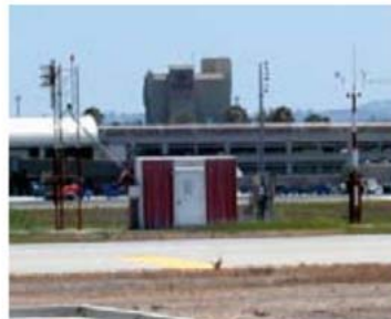
Fig. 10 Glide Slope Antenna

For simplicity, think of the glide slope as being a localizer turned on its side. However, unlike the localizer antenna, the glide slope antenna is normally 750-1250 down the runway and between 400 and 600 feet to one side of the centerline. At times the glide slope antenna will