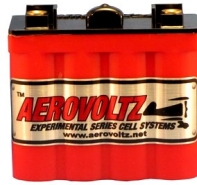
AV008 8 Cell Lithium Iron Phosphate Experimental Battery with balance charging port