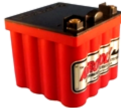
AV016 16 Cell Lithium Iron Phosphate Experimental Battery with balance charge port