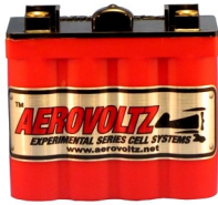
AV012 12 Cell Lithium Iron Phosphate Experimental Battery with balance charging port