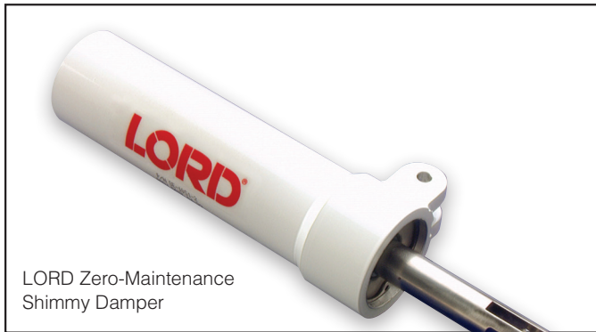
LORD Zero-Maintenance Shimmy Damper

The LORD® fluid-free shimmy damper offers high-performance damping and vibration control with a zero-maintenance design. It uses surface-effect technology to provide consistent damping for fixed and retractable landing nose gears. Instead of using fluids to resist motion, the shimmy damper features a unique elastomer formulation to absorb nose wheel shimmy. Since there is no fluid, this damper will never leak.